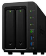
Safeplan onsite NAS