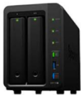
Safeplan onsite NAS